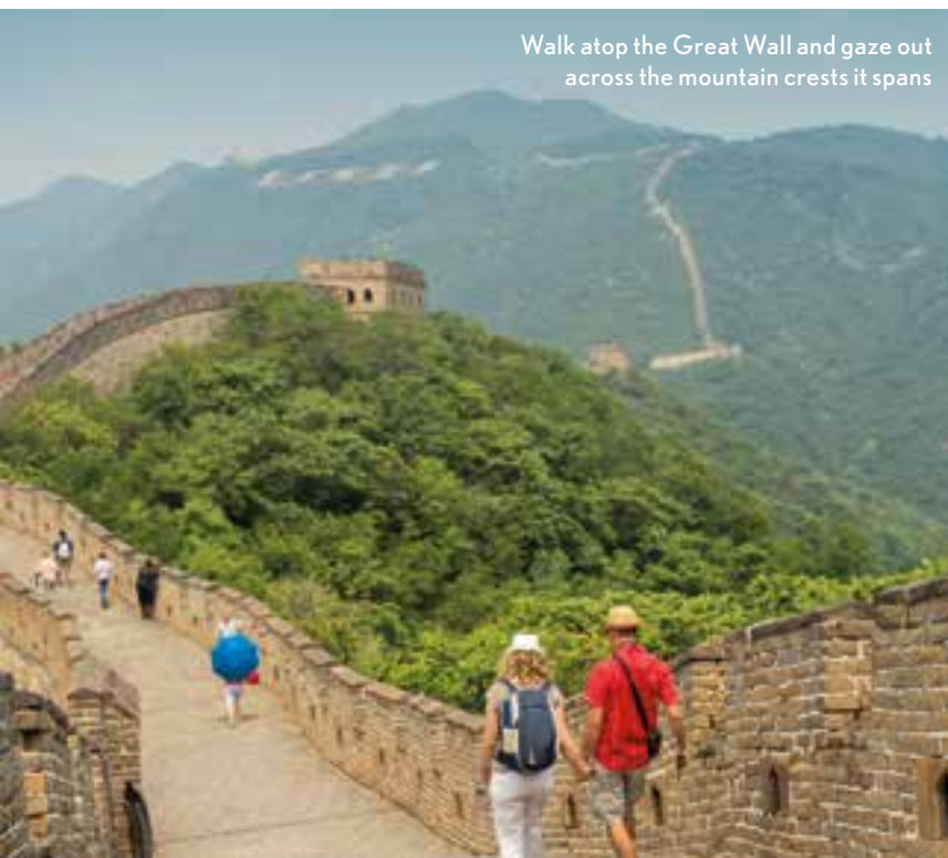
Walk atop the Great Wall and gaze out across the mountain crests it spans

Start your morning with tai chi on the deck before breakfast. Disembark in the small city of Fuling and enjoy a shore excursion, beginning with a visit to the White Crane Ridge Underwater Museum. Descend 150 feet underwater to see centuries-old rock carvings. Afterward, continue to a local