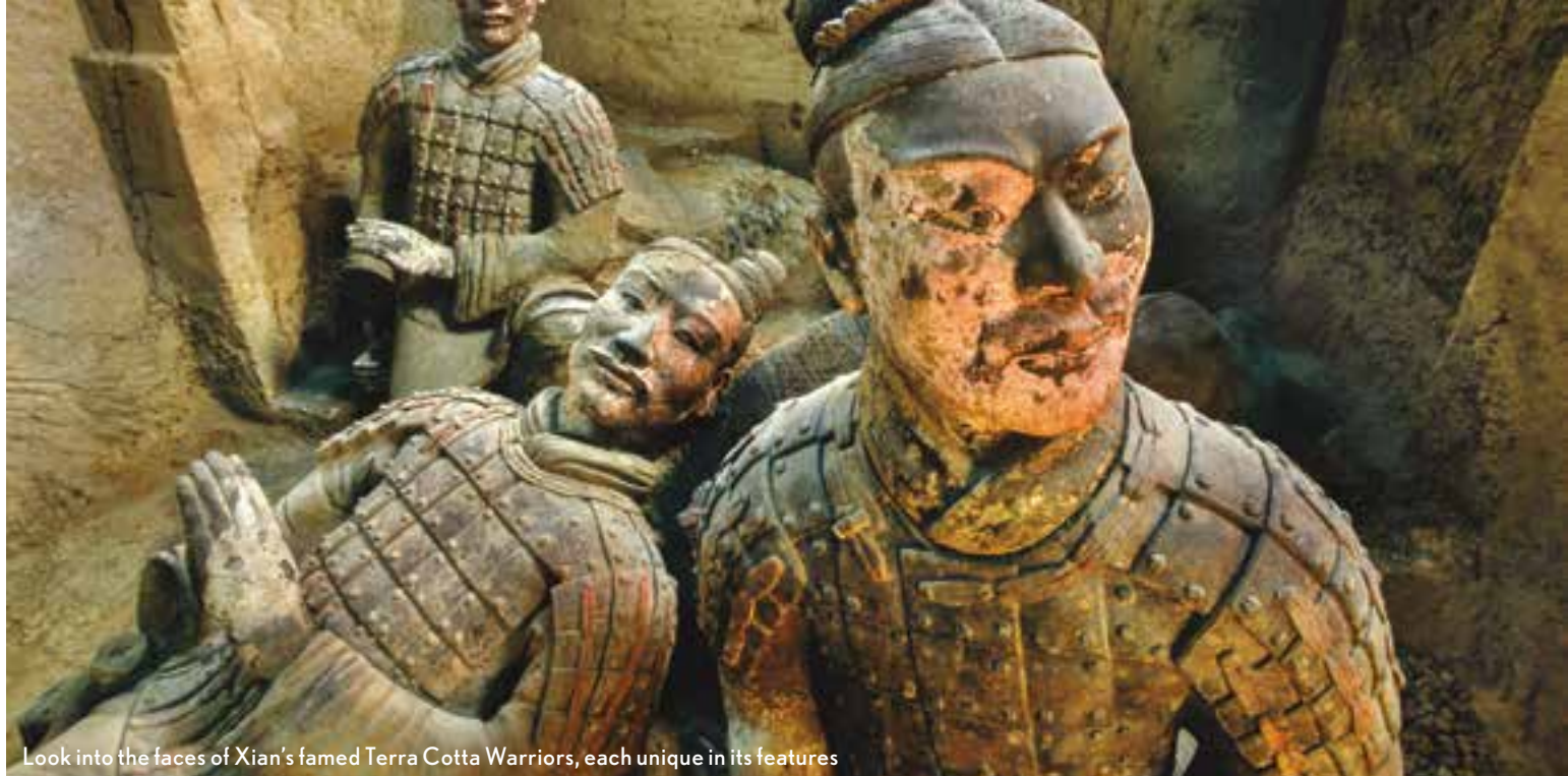
Look into the faces of Xian's famed Terra Cotta Warriors, each unique in its features

market to gain insight into the region's rich culinary culture. This afternoon, learn about Chinese traditional medicine and reflexology. Tonight, attend the Captain's Reception. 'Sanctuary Yangzi Explorer' | Meals: B L D