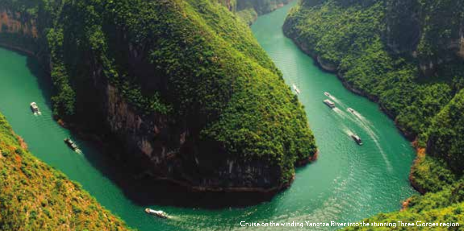
Cruise on the winding Yangtze River into the stunning Three Gorges region

chi. Then, learn about unique, centuries-old matchmaking techniques still in use today, before checking in to your hotel, where you observe a traditional tea demonstration.