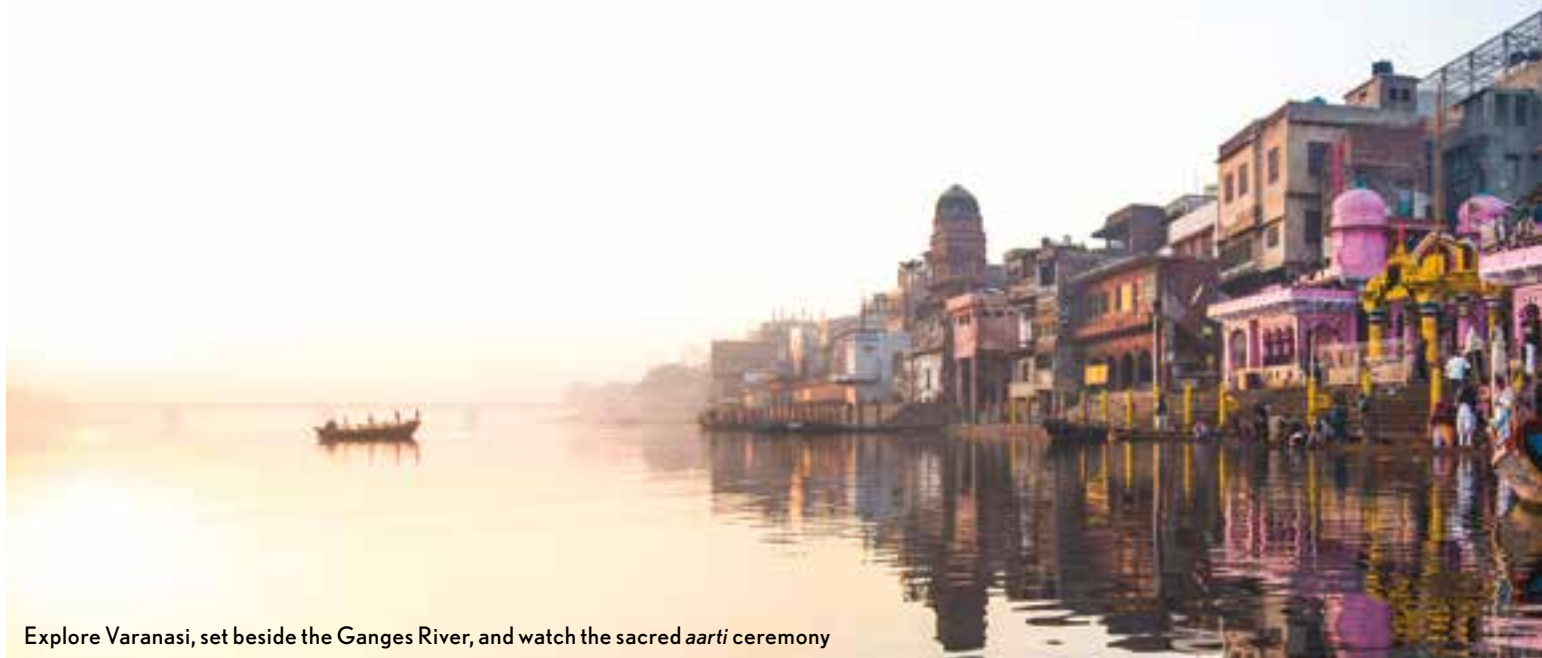
Explore Varanasi, set beside the Ganges River, and watch the sacred aarti ceremony