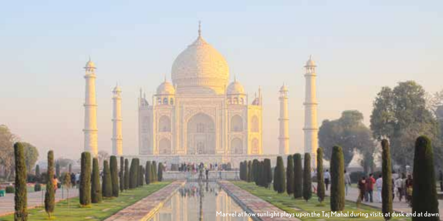
Marvel at how sunlight plays upon the Taj Mahal during visits at dusk and at dawn

Return to your hotel for an evening at leisure. Rambagh Palace, Jaipur | Meals: B D (Day 5); B L (Day 6)