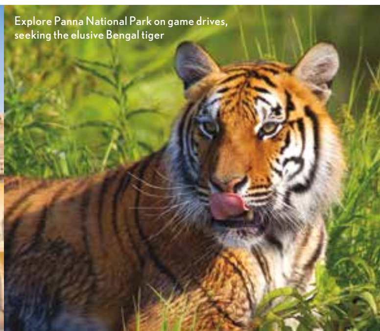
Explore Panna National Park on game drives, seeking the elusive Bengal tiger