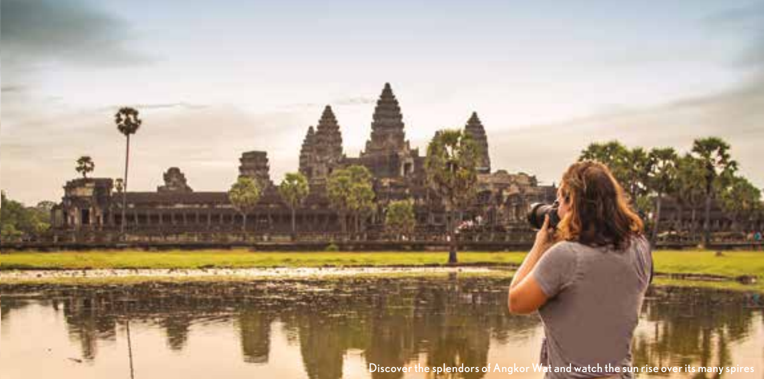
Discover the splendors of Angkor Wat and watch the sun rise over its many spires

Changing from cyclo to vehicle, continue along Nguyen Dinh Chieu Street to visit a little-known, hard-to-find weapons bunker, as well as a food market and flower market. Then sample some of the city's most sensational pho at one of its best-kept-secret restaurants. Return to your hotel to enjoy the rest of the morning at leisure. This afternoon, view examples of the city's colonial legacy, including the Reunification Palace and the Central Post Office. Tonight, gather for dinner at a local culinary hot spot.