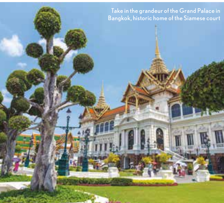
Take in the grandeur of the Grand Palace in Bangkok, historic home of the Siamese court