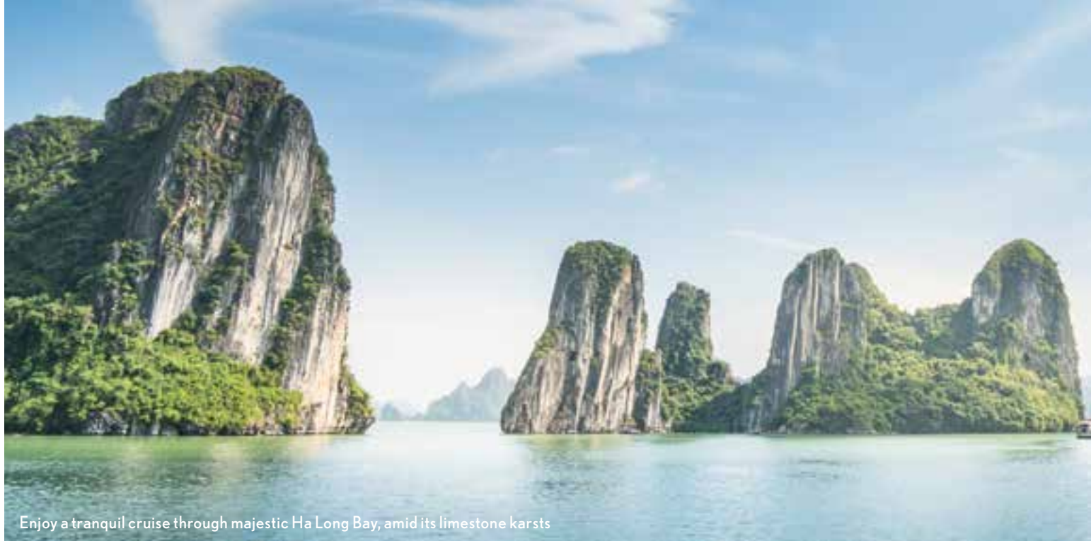
Enjoy a tranquil cruise through majestic Ha Long Bay, amid its limestone karsts