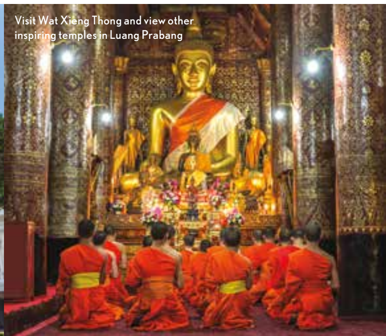
Visit Wat Xieng Thong and view other inspiring temples in Luang Prabang