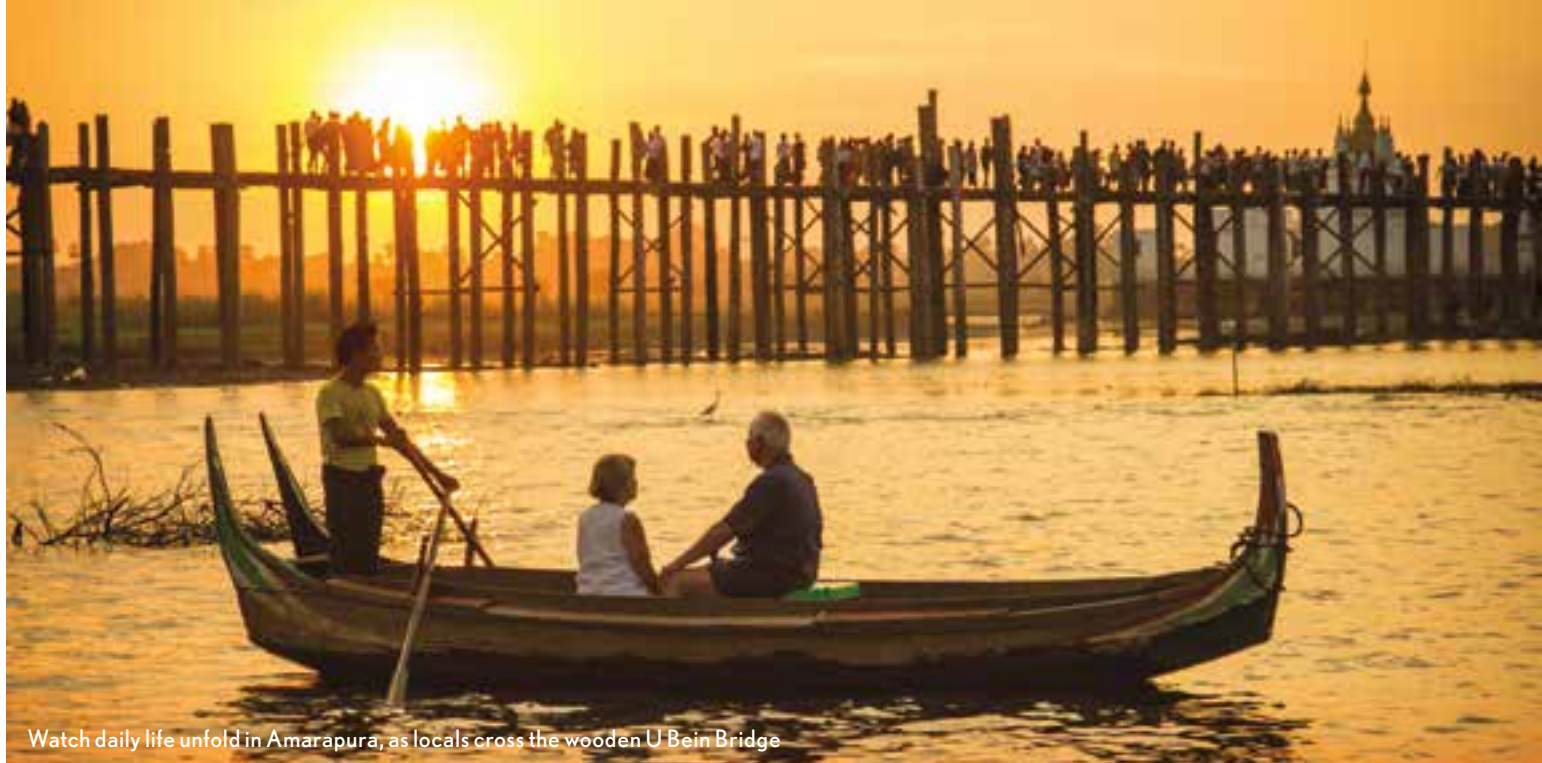
Watch daily life unfold in Amarapura, as locals cross the wooden U Bein Bridge

at Kuthodaw Pagoda, referred to as the biggest book in the world. Later, witness evening prayers at Shwe Kyin Monastery. Rupar Mandalay Resort | Meals: B L