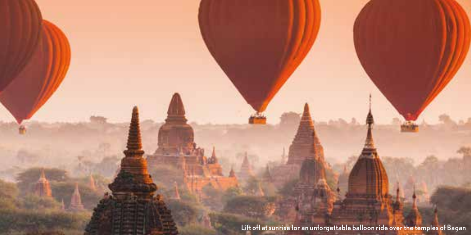
Lift off at sunrise for an unforgettable balloon ride over the temples of Bagan

Burmese cloth worn by men and women) and thanakha (a white cosmetic paste made from ground bark).