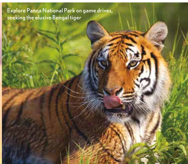
Explore Panna National Park on game drives, seeking the elusive Bengal tiger