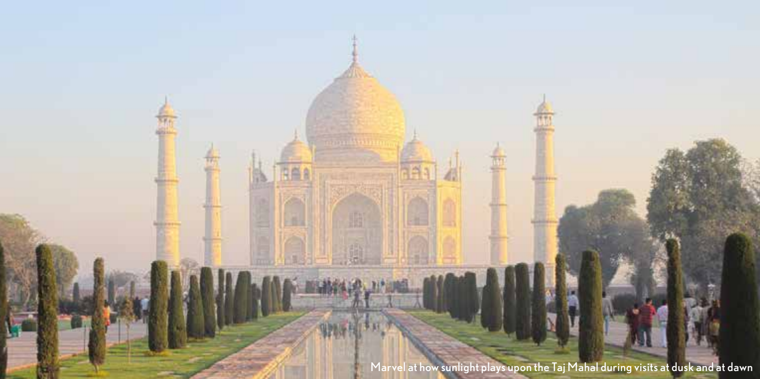
Marvel at how sunlight plays upon the Taj Mahal during visits at dusk and at dawn