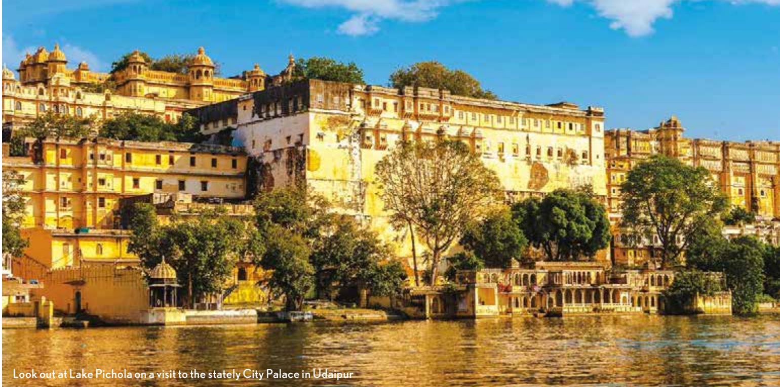
Look out at Lake Pichola on a visit to the stately City Palace in Udaipur

National Park with the Bengal tiger, on an A&K-exclusive experience. Pashan Garh, Panna National Park | Meals: B L D