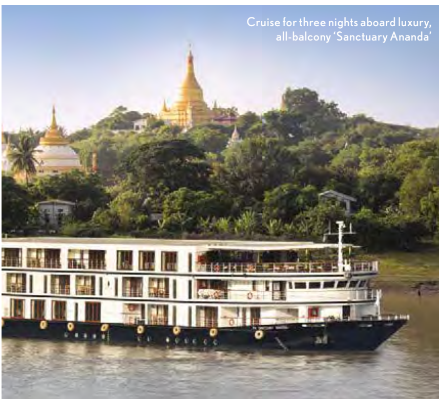
Cruise for three nights aboard luxury, all-balcony 'Sanctuary Ananda'

After breakfast on board, explore a gold-leaf workshop, where the metal is hammered paper-thin and prepared for use in some of Myanmar's holiest sites. This afternoon, visit the Shwenandaw Monastery and view the more than