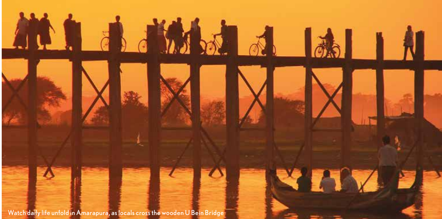
Watch daily life unfold in Amarapura, as locals cross the wooden U Bein Bridge

700 marble slabs inscribed with Buddhist religious texts at Kuthodaw Pagoda, referred to as the biggest book in the world. Later, witness evening prayers at Shwe Kyin Monastery. Rupar Mandalay Resort | Meals: B L