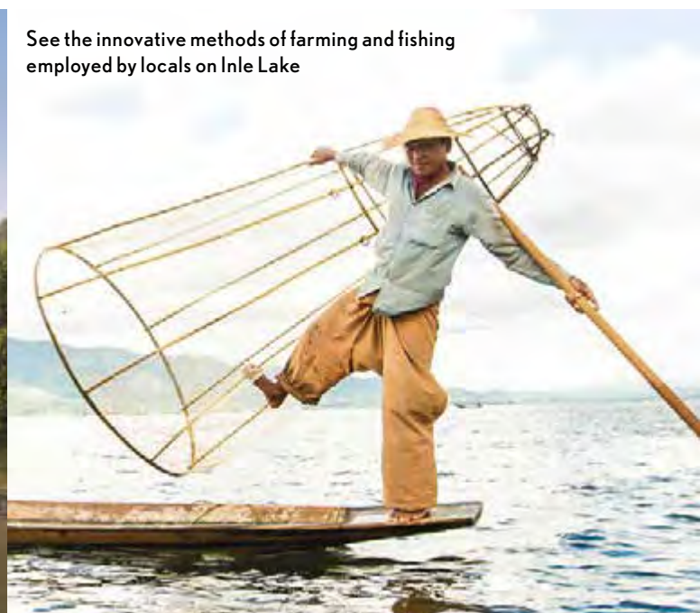
See the innovative methods of farming and fishing employed by locals on Inle Lake