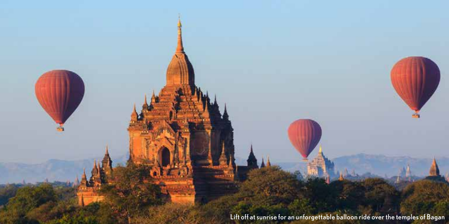
Lift off at sunrise for an unforgettable balloon ride over the temples of Bagan

for the future, followed by demonstrations of the longyi (traditional Burmese cloth worn by men and women) and thanakha (a white cosmetic paste made from ground bark).