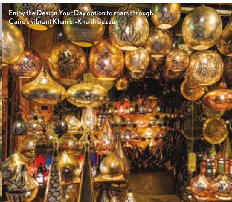
Enjoy the Design Your Day option to roam through Cairo’s vibrant Khan el-Khalili Bazaar