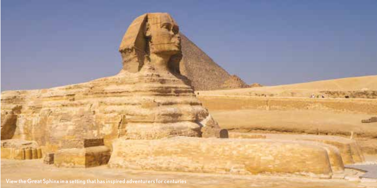
View the Great Sphinx in a setting that has inspired adventurers for centuries

with an onboard chef. Later this afternoon, enjoy a refreshing Scenic Sundowner as you cruise to Kom Ombo. Disembark at Kom Ombo (hill of gold) to visit the Greco-Roman temple dedicated to Haroeris (the sun god) and Sobek (the crocodile god), whom some ancient Egyptians considered the creator of the world. View the mummified remains of several crocodiles that once basked along the ancient Nile shore, just as their descendants do today. ‘Sanctuary Sun Boat IV’ | Meals: B L D