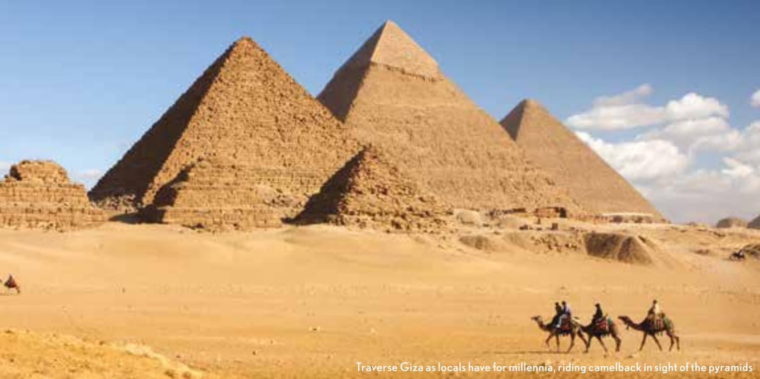
Traverse Giza as locals have for millennia, riding camelback in sight of the pyramids

boy king,” Tutankhamun. Enter the tomb of Tutankhamun — found in 1922 by British archaeologist and Egyptologist Howard Carter — to discover the secrets of this storied chamber. Next, descend into the beautifully decorated tomb of Seti I, the father of Ramses II, one of the best-preserved tombs in the valley. ‘Sanctuary Sun Boat IV’ | Meals: B L D