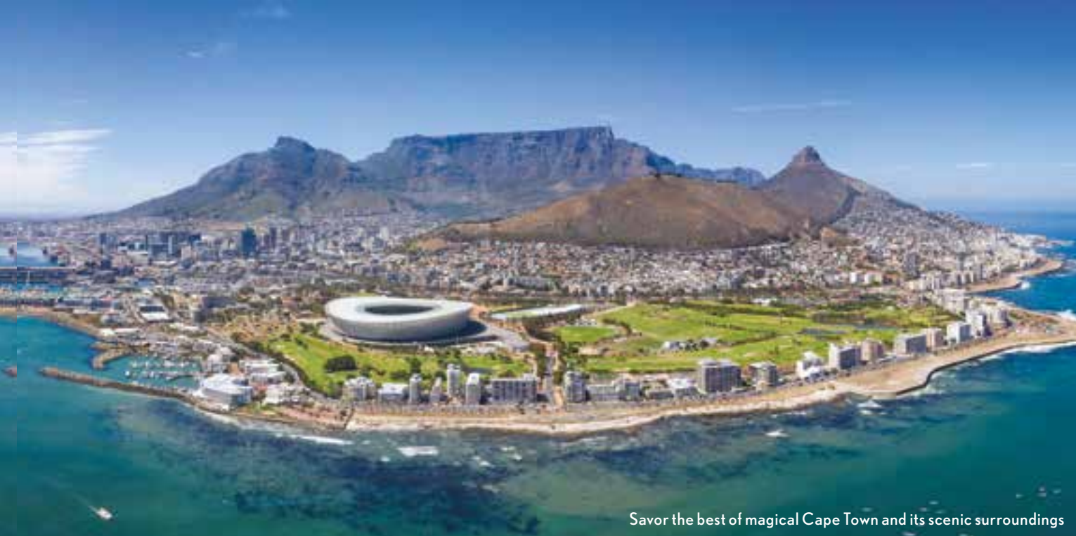
Savor the best of magical Cape Town and its scenic surroundings

visit its colony of endangered African penguins; accustomed to humans, they provide endless photo opportunities.