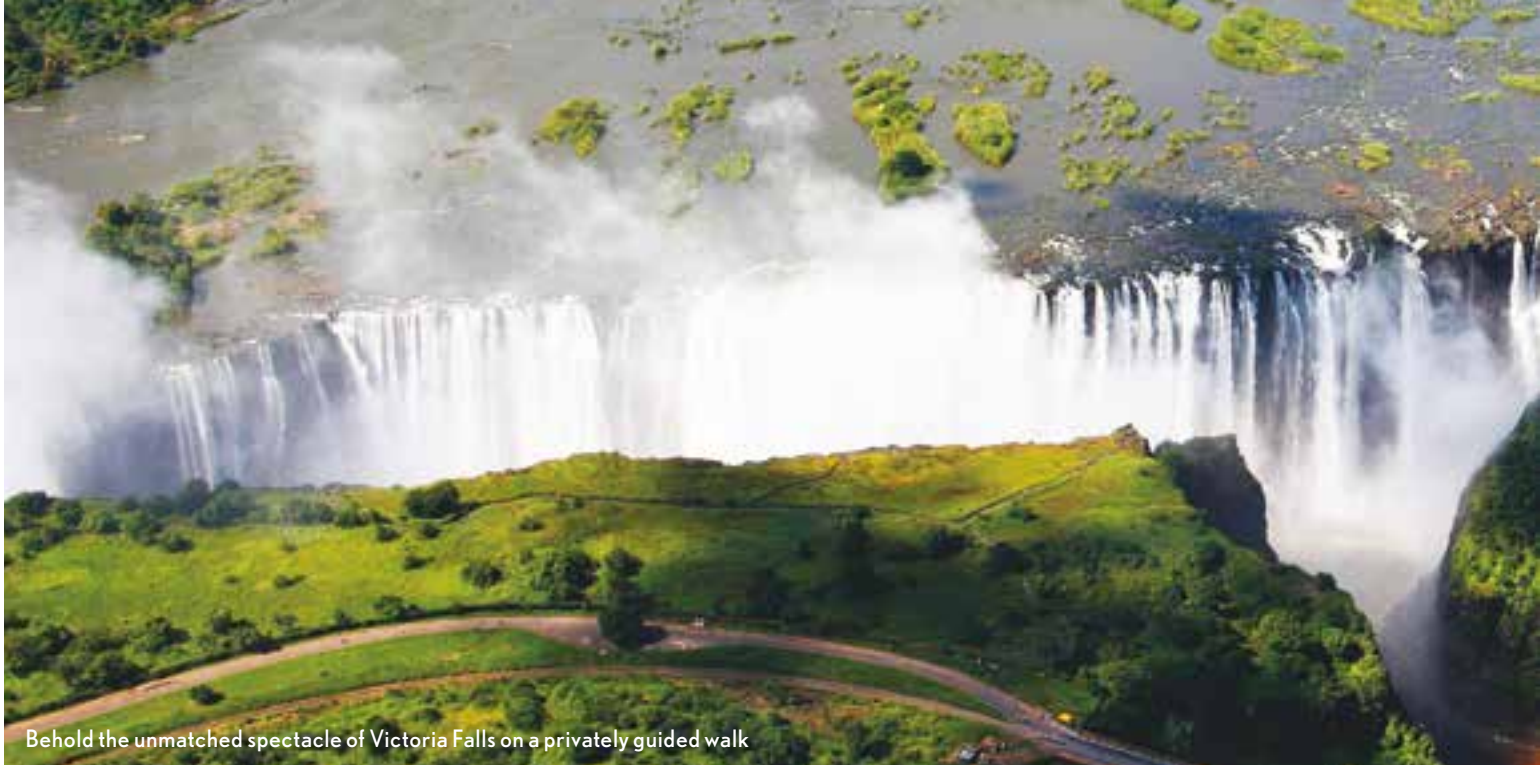
Behold the unmatched spectacle of Victoria Falls on a privately guided walk

DAY 5-6: Greater Kruger Area | Sighting Africa's Big Five Begin two days of immersion in your private game reserve, embarking on game drives in open safari vehicles for optimal viewing and exploring on early morning game walks with your ranger. This region of Africa is noted for its high density of wildlife, which often appear just steps in front of you. As you explore, learn about the flora and fauna as well as basic tracking skills. In between safari activities, participate in an A&K Chef's Table culinary experience, preparing a traditional South African dish. At dusk, stop for a Scenic Sundowner, and then search for nocturnal animals. Return to your lodge for dinner. Lion Sands River Lodge | Meals: B L D