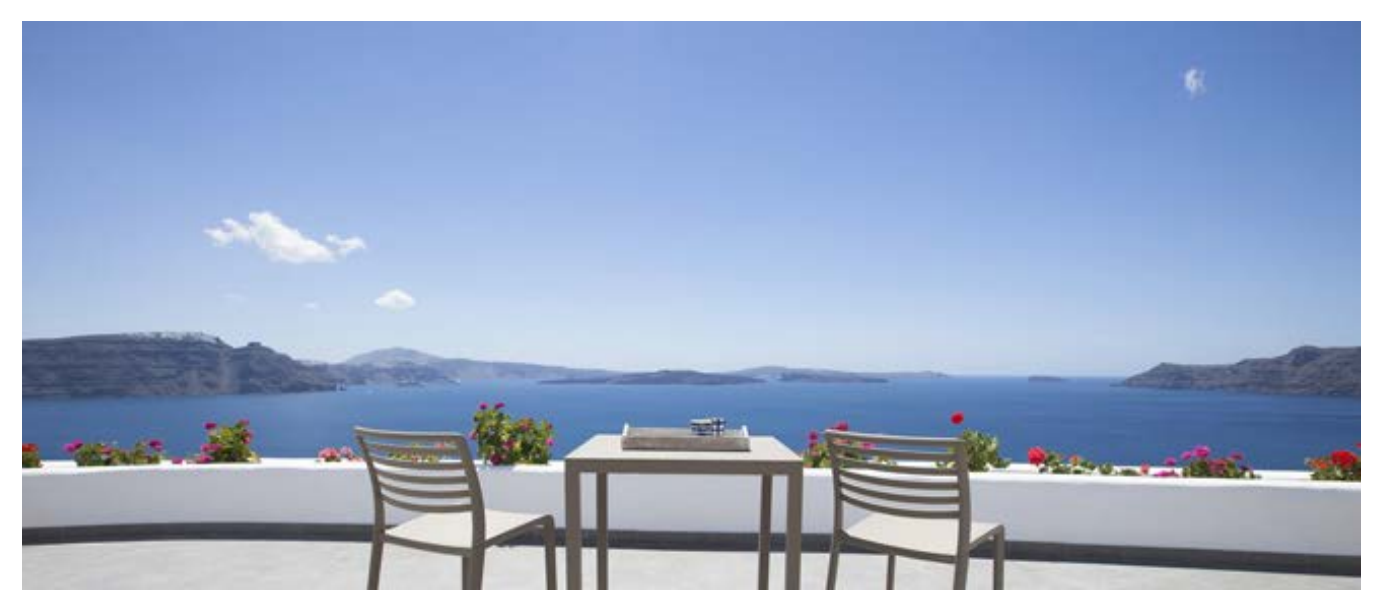
Tuesday Accommodation: Santorini Secret Suites & Spa

1 Pure Suite with Private Hot Tub and Caldera View for 3 nights