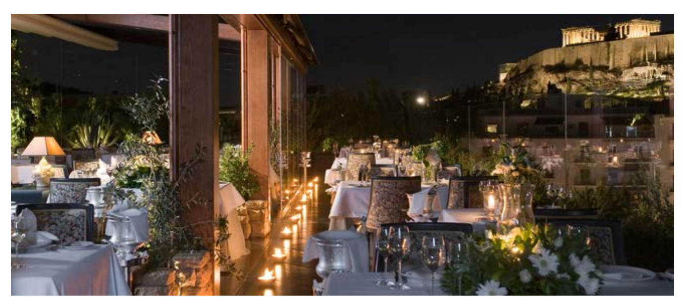
Friday Accommodation: Royal Olympic Hotel