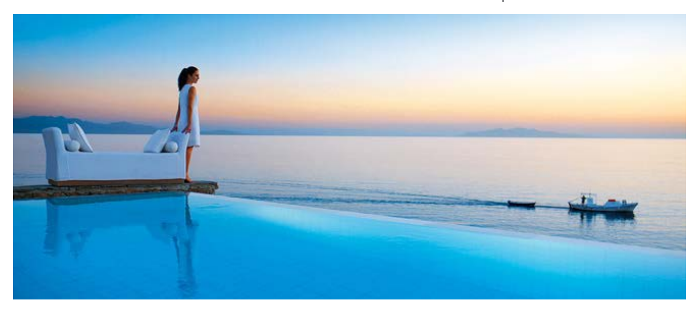
Saturday Accommodation: Petasos Beach Resort and Spa

1 Superior Room with Sea View and Jacuzzi for 3 nights